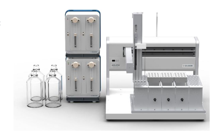
Figure 1 Gilson ASPEC® 274 System

This application note discusses a simple SPE urine extraction using the Gilson ASPEC® 274 System (refer to Figure 1) prior to LC/MS-MS to confirm the presence of 15 spiked benzodiazepine analytes.